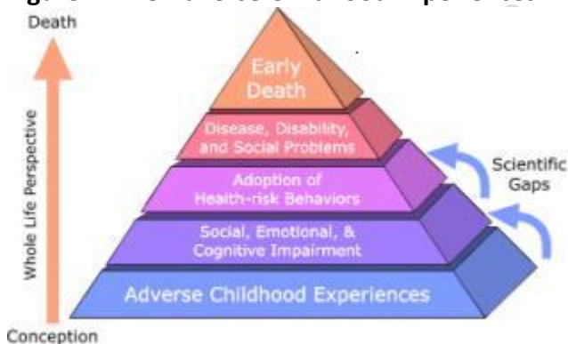
Figure 1: The Adverse Childhood Experiences